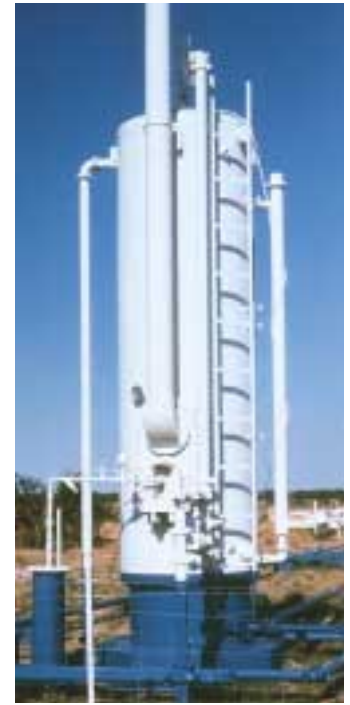
Heater treater and other production piping.