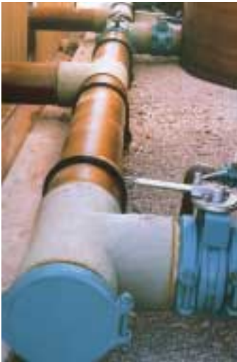
Joins FRP and other specialty piping.