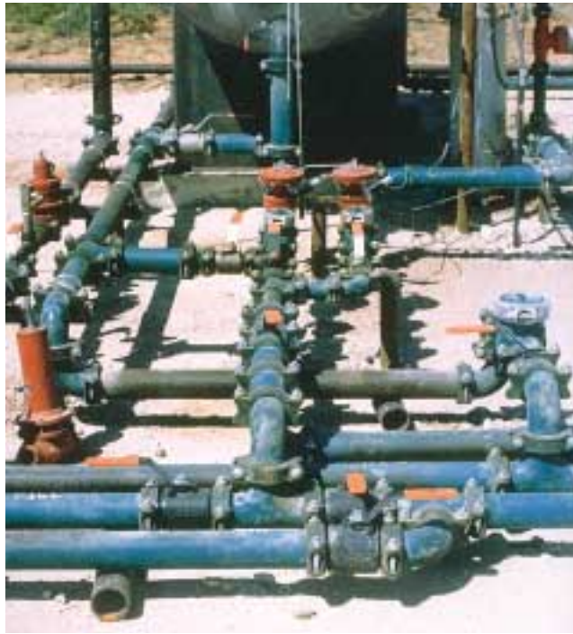
Complete tank battery piping from wellhead to pipe line – couplings, fittings, valves.