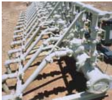
Automated grooved valves complete remote header packages.