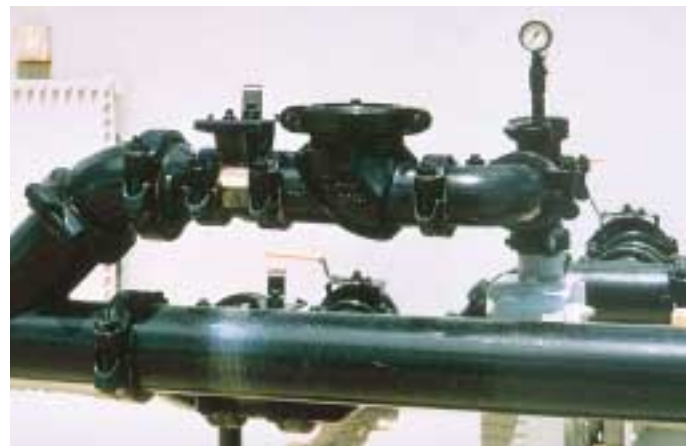
Grooved system components are easily internally epoxy coated and assembled with two bolts.