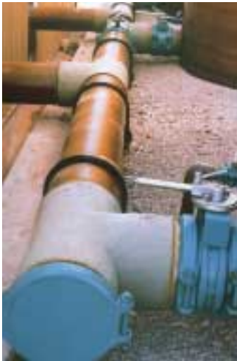
Joins FRP and other specialty piping.