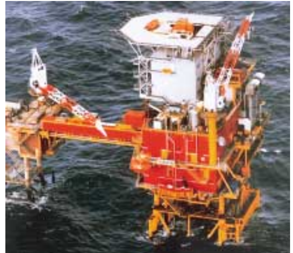
Complete offshore mud return, drain, water and other production lines.