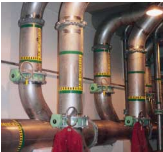
Sewage, water treatment, and compressed air are among typical services with Victaulic stainless steel systems.