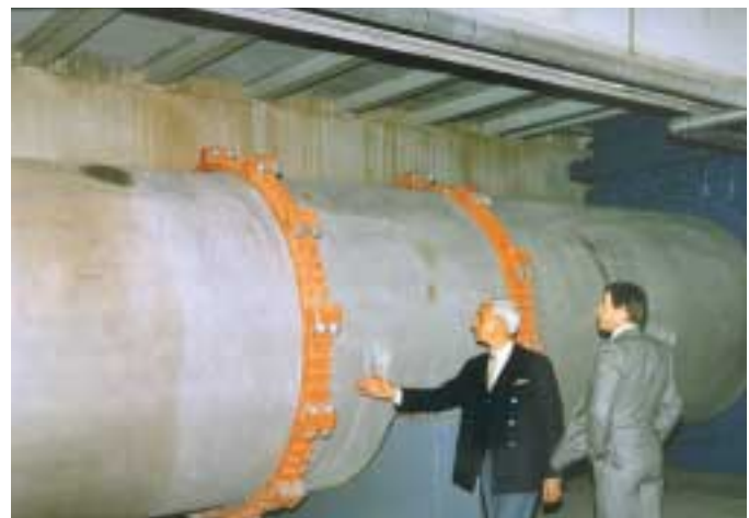
Couplings as large as 102" (2590.8 mm) have been used for large infalls, outfalls and treatment plant piping.