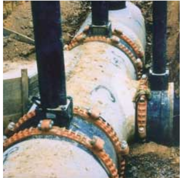
Large diameter valve settings are faster, easier, lighter and much more compact.