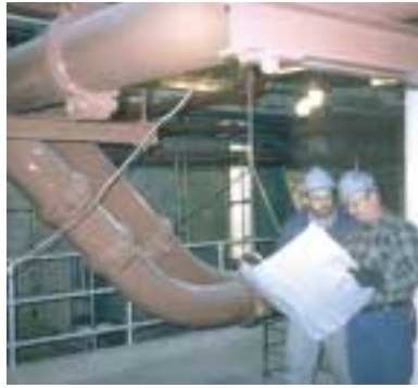
Double grooved Duo-Lock™ couplings provide high pressure compatibility for sludge cake piping systems.