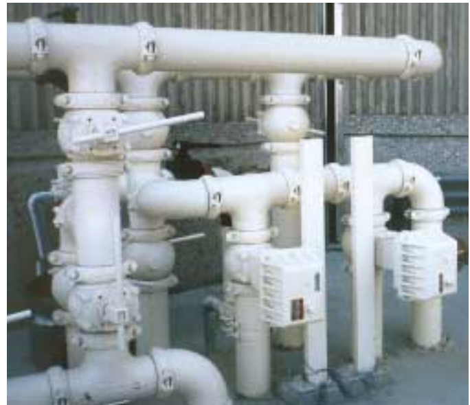
Vic-Plug™ valves provide grooved end assembly ease with manual or automated control as needed.