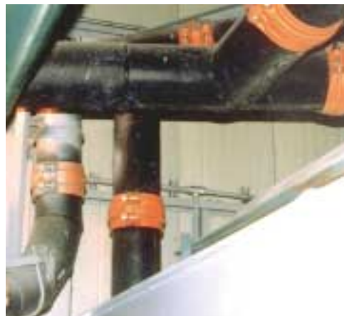
Victaulic HDPE couplings eliminate fusing, provide direct transition to grooved steel systems.