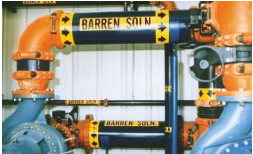
From severe services for leaching and process piping to air and water, Victaulic systems can handle it.