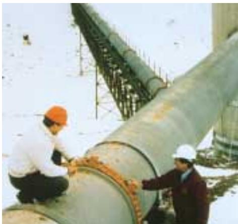
Tailings and other large diameter lines are easily assembled with Victaulic couplings.