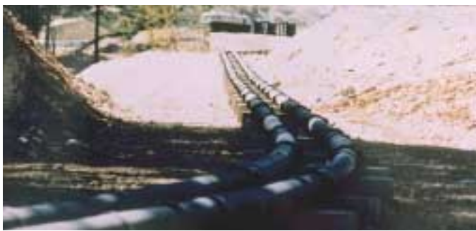
Rubber/urethane and other lined/coated pipe and fittings are easily assembled with Victaulic products.