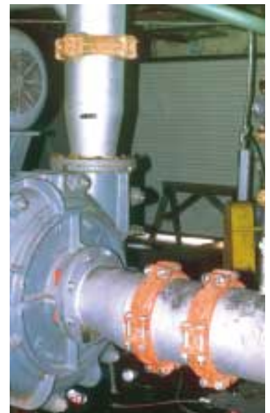
Plain systems leave full wall thickness for abrasive services.