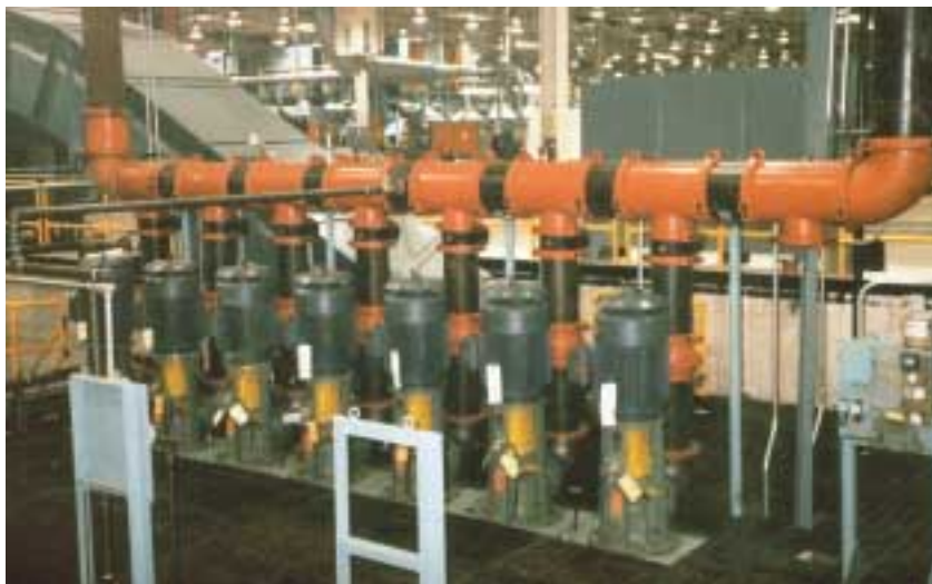
Process heating, cooling, lubrication, waste and utility piping.