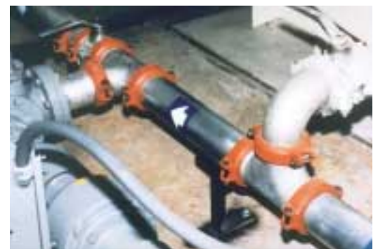
Food processing, chemicals and pharmaceutical services.