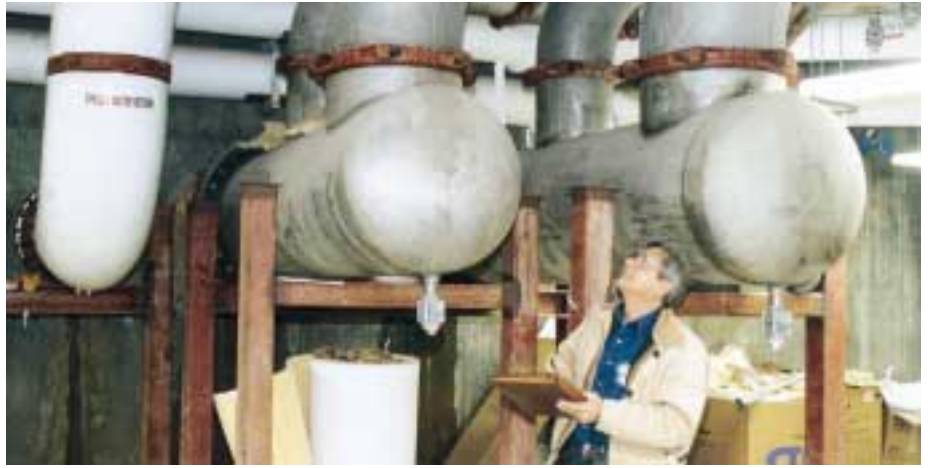
Stainless piping up to 24" (609.6 mm) is available for services such as these deionized water supply lines.