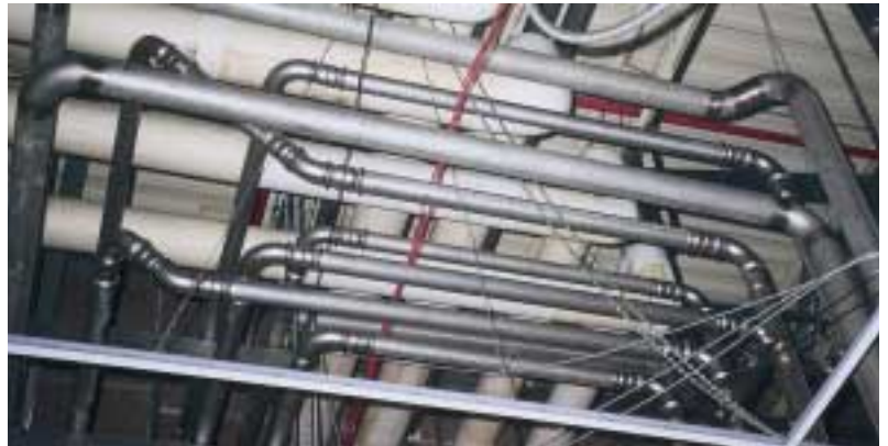
The Pressfit System is easily installed in confined locations for compressed air, chemical, plant, lubrication and similar services.