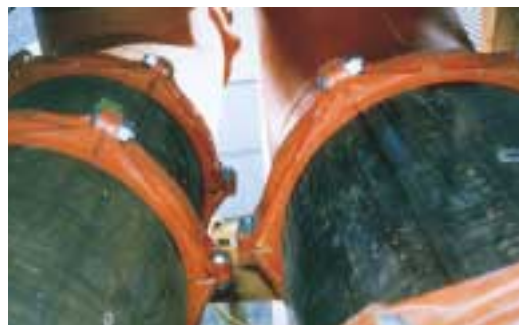
Large diameter up to 48" (1219.2 mm).