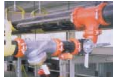
Circuit balancing valves for precise zone control heating/cooling.