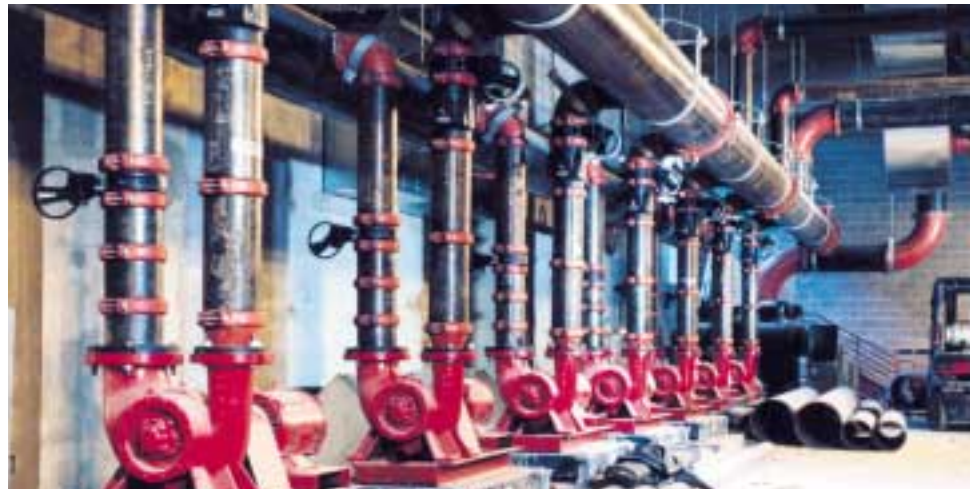
Complete mechanical room piping systems.