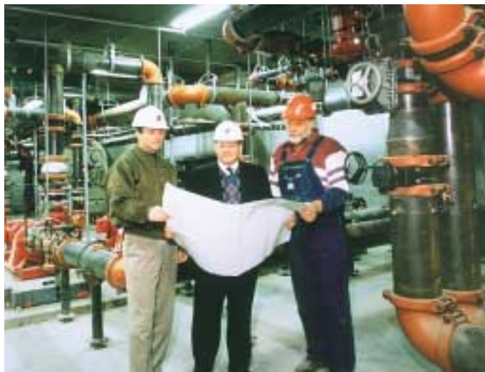
Total systems design from pumps and equipment to supply, return and related systems.