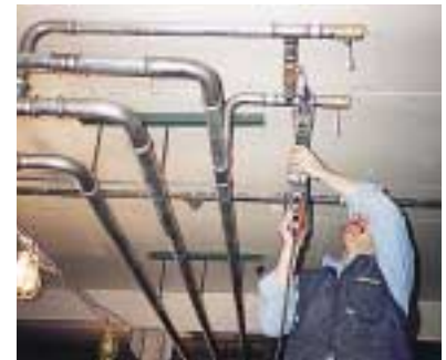
The Pressfit® System speeds small pipe installation.