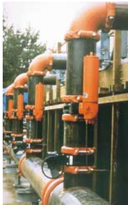
Automated valves for heating and cooling flow control.