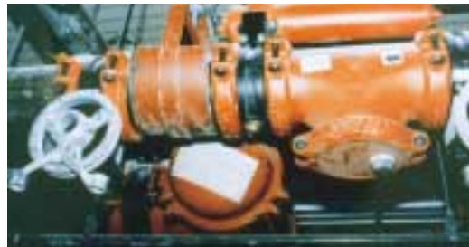
Automated valves, strainers and other accessories.