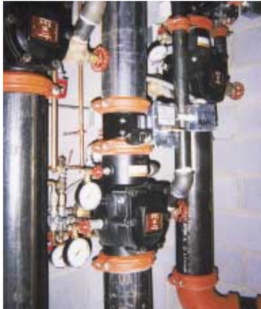
Victaulic grooved products combine with Viking devices for a complete systems package.