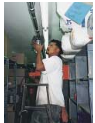
The Pressfit System for branch lines, grids and trees.