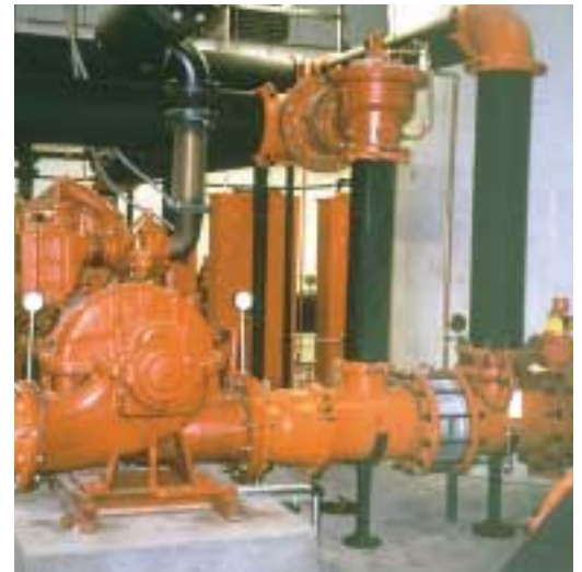
Complete fire pump piping, including main water supply, siamese supply, test loop and riser connections