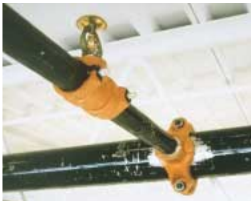
The FIT® system provides a plain end alternative to threaded and coupled tree, grid or calculated sprinkler systems.