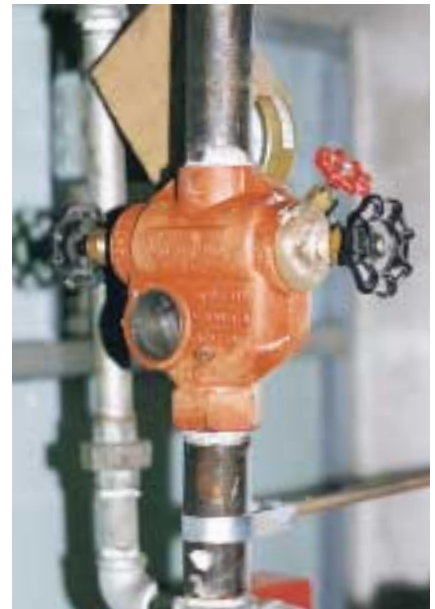
TestMaster™ alarm test module, FireBall® valves plus FireLock® check and other valves provide systems flow control.