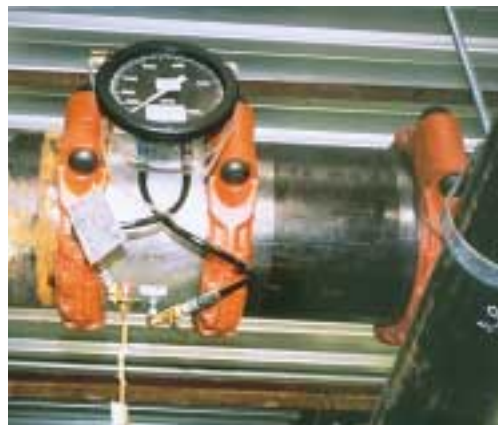
Fire pump test meters and accessories for fire systems.